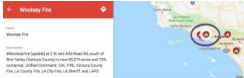
Woolsey Fire (click for larger image)

It was just over a year ago that fires swept through northern California wine country. We posted a link to various resources. Now the fires are back. The two largest are the Camp Fire in Butte County and the Woolsey Fire in Malibu . There are many others. Normally the winter rains would have started by now. Not this year, our bad luck. This is our very unofficial guide to California fire donation resources .