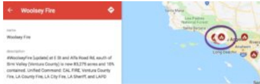
Woolsey Fire (click for larger image)

It was just over a year ago that fires swept through northern California wine country. We posted a link to various resources. Now the fires are back. The two largest are the Camp Fire in Butte County and the Woolsey Fire in Malibu . There are many others. Normally the winter rains would have started by now. Not this year, our bad luck. This is our very unofficial guide to California fire donation resources .