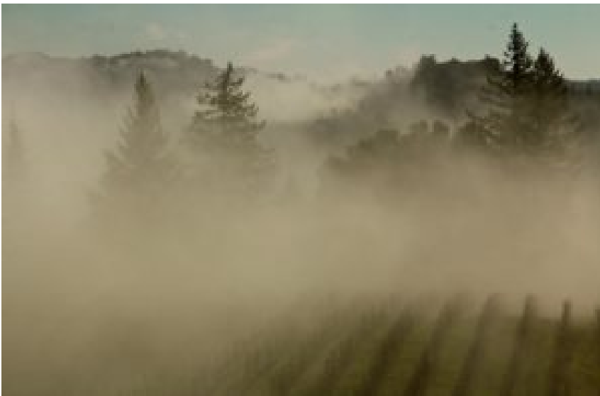
Fog Over Perli Vineyard (click for larger image)