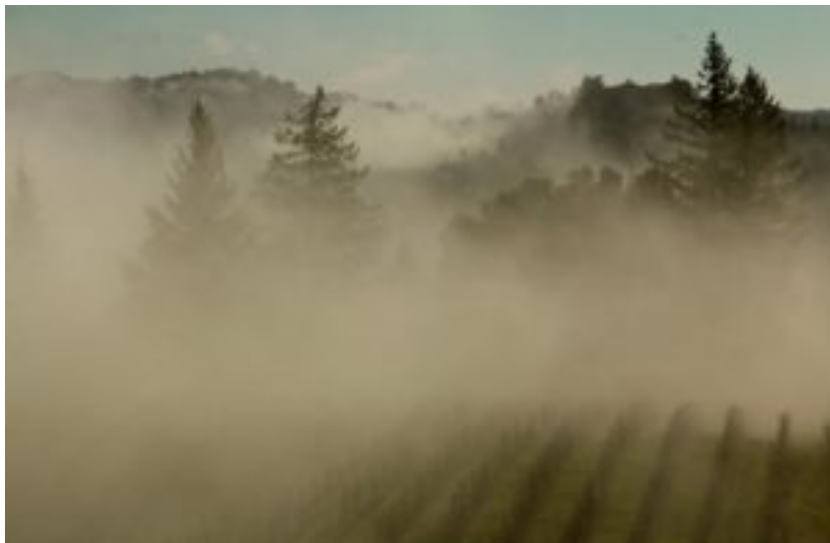
Fog Over Perli Vineyard (click for larger image)