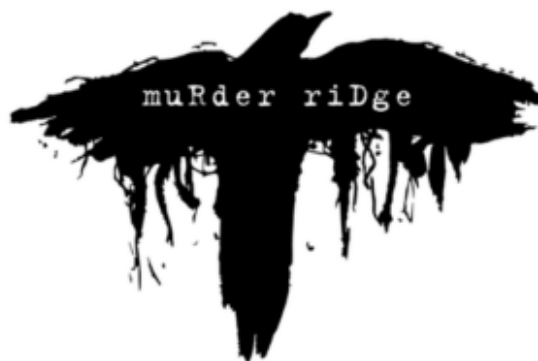
Murder Ridge Logo

The Murder Ridge wine club is called a Murder of Crows. Hence the excellent logo: