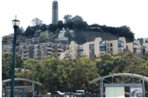
Coit Tower from Pier 27 (click for larger image)

And we were not disappointed. We visited fourteen wineries pouring pinot noir . These were the wineries new to us. Four old favorites continue their excellent work. We'll say a bit more about the pluses and minuses of the venue at the end of this summary.