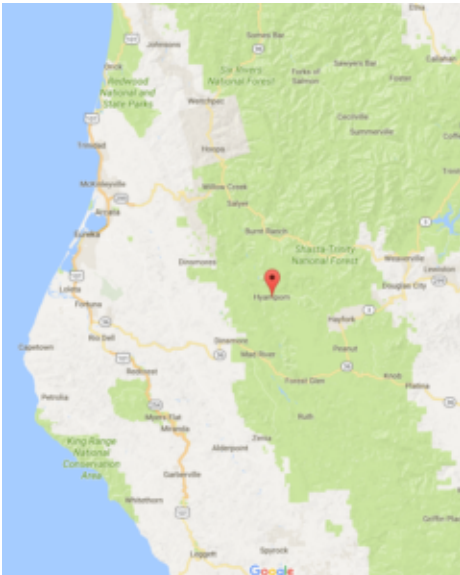
Hyampom, California (click for larger image)

Most original name: Murder Ridge , located on a ridge where there was actually a murder in 1911.